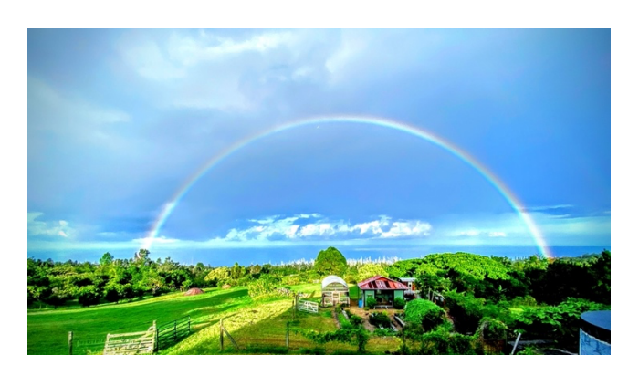
February 2-7, 2025 (week 1) and/or February 9-14, 2025 (week 2) Kona, Hawaii

Much is happening on the world stage right now and distractions are in abundance. How can you stay centered in a world that continually throws you off balance on purpose? You are here to master your frequencies in this multi-frequential, hall of mirrors. By remembering and going within, you find all the answers to everything you ever wanted to know and more.